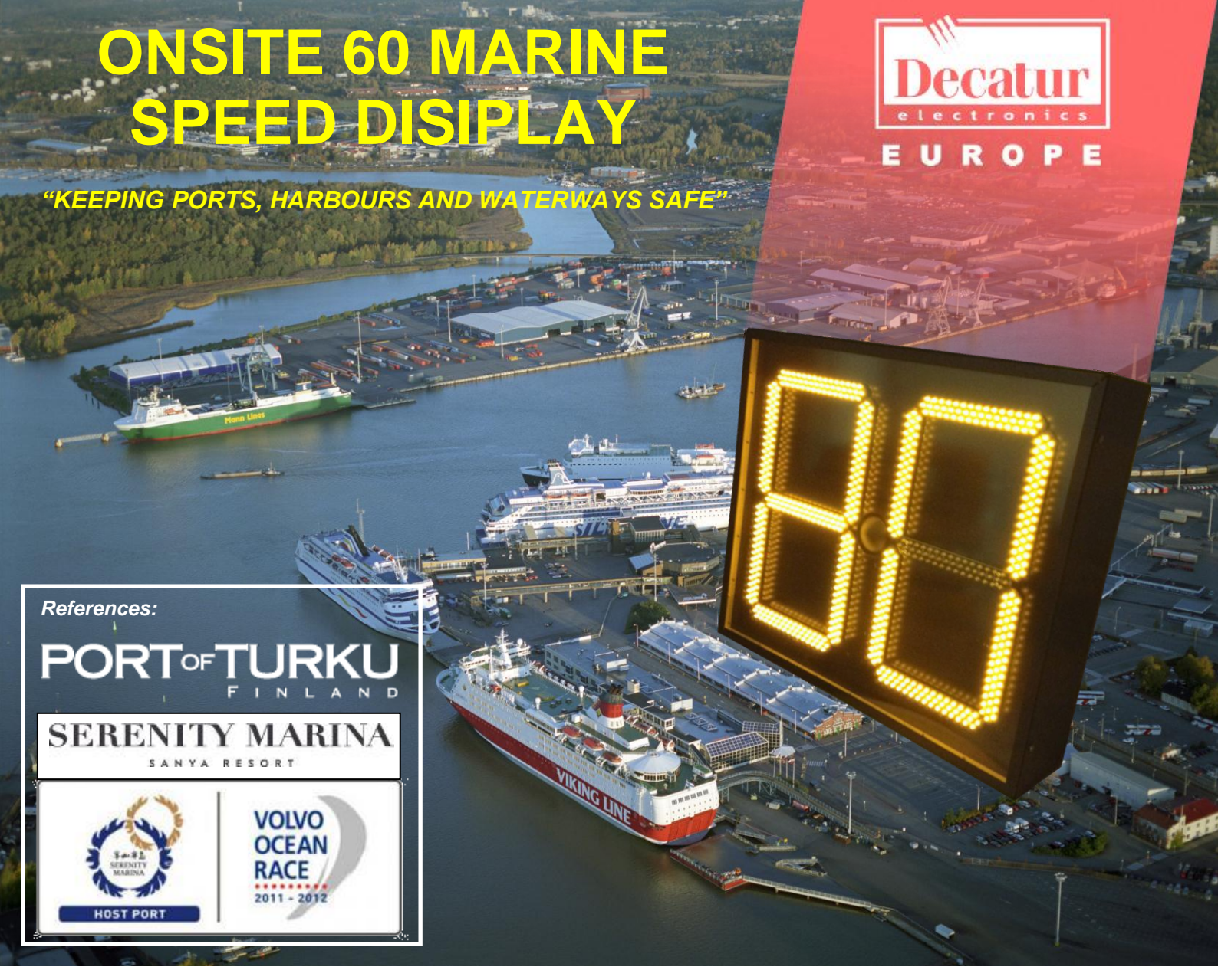
HIGHLY VISIBLY SPEED DISPLAY FOR HARBOURS AND WATERWAYS

Onsite 60 Marine is two digit speed display with two 60 cm high digits with optional 15-20 cm high LED texts to identify speed unit e.g. Km/h, KPH, MPH or Knot. Display has built in radar and power source. Optionally unit is available with rechargeable batteries or solar panels. Automatic brightness adjustment adjusts LED brightness to fit in all lighting conditions and increases operating time when powered with battery or solar panel system.