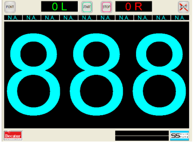
Remote Speed & Alert Display (CCI)

Data collection function is included to Advance Control Centre Interface (ACCI). With ACCI it is also possible to change display & radar settings remotely as well.